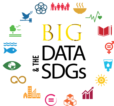
Figure 1 Big data and the SDGs