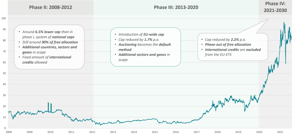
Figure 1: Developments of Carbon Prices in EUR per certificate from 2008 to 2021.

Under the Fit-for-55 initiative, the EU decided to further improve the EU-ETS trading system during Phase 4 (2021-2030), especially as in the past the incentives for multinationals to buy / sell the certificates was limited due to a rather low price. <sup>9</sup> Germany implemented a national emission trading system, the so-called nEHS, which exists for certain